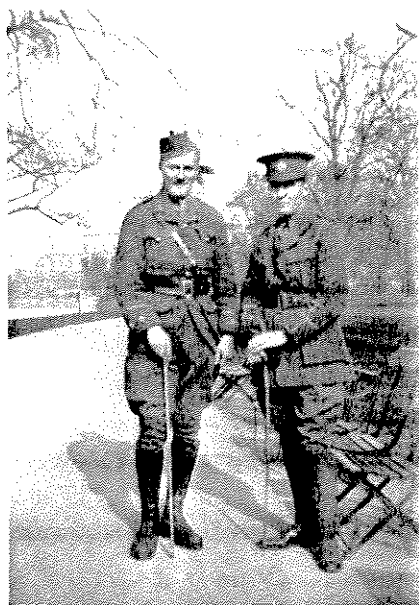
S r James' Park London April 10 th 1915.